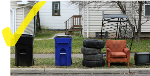
All waste/garbage in carts Bulk items separated Yard waste bundled

*As shown, 1st full week of month (tires/bulk)