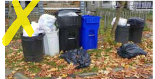
Excess waste outside of cart Use of improper waste containers

For more information on set out services for large volumes or to purchase additional carts, call us at (216) 664-3711.